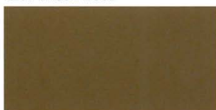
2202 BEECH TREE