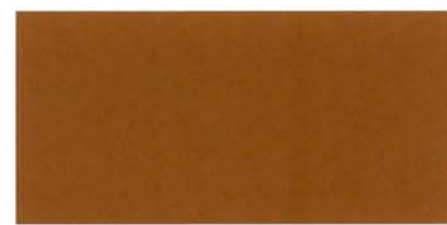
2103 FIRED BRICK