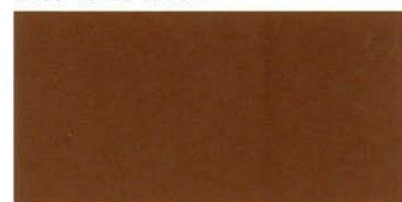
2601 REDWOOD TILE