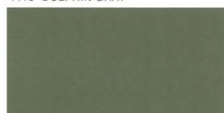
4501 SLATE GREEN