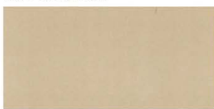
3304 PROVINCIAL TAN